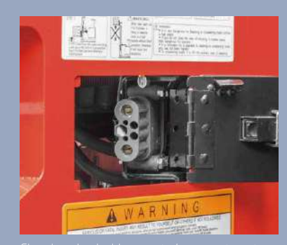
Charging plug inside operator's compartment, this eliminates the need to disconnect the plug from battery, enhancing ease of operation (Std.