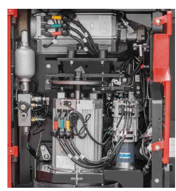
The loading wheels with hydraulic braking make the braking distance shorter and safer