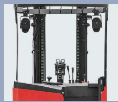
New designed mast and the large open stee